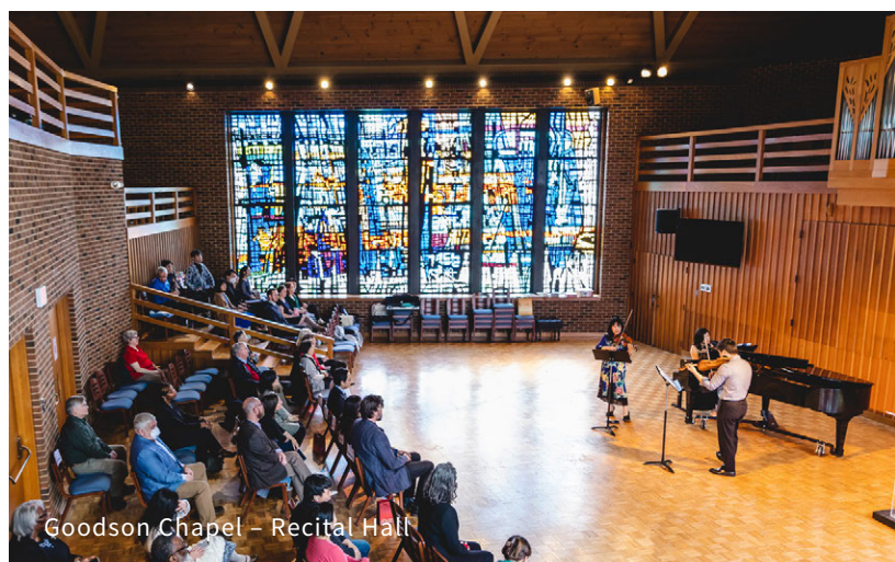
Goodson Chapel - Recital Hall