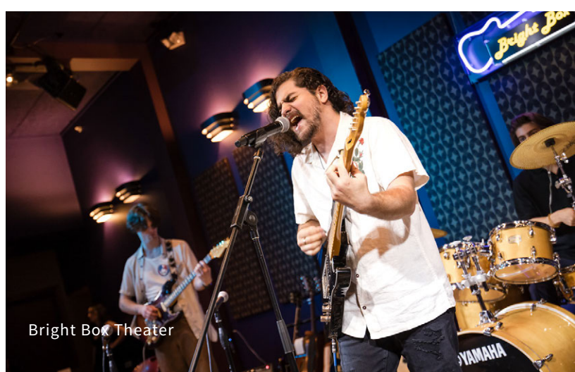
Bright Box Theater