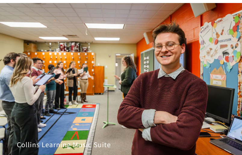
Collins Learning Music Suite