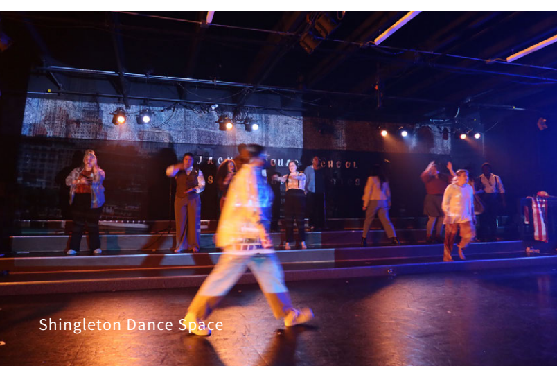
Shingleton Dance Space