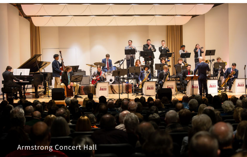
Armstrong Concert Hall