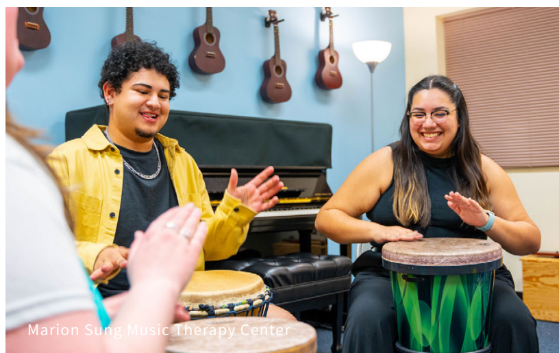
Marion Sung Music Therapy Center