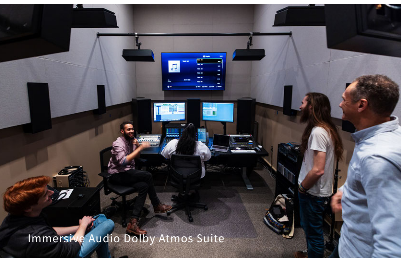
Immersive Audio Dolby Atmos Suite