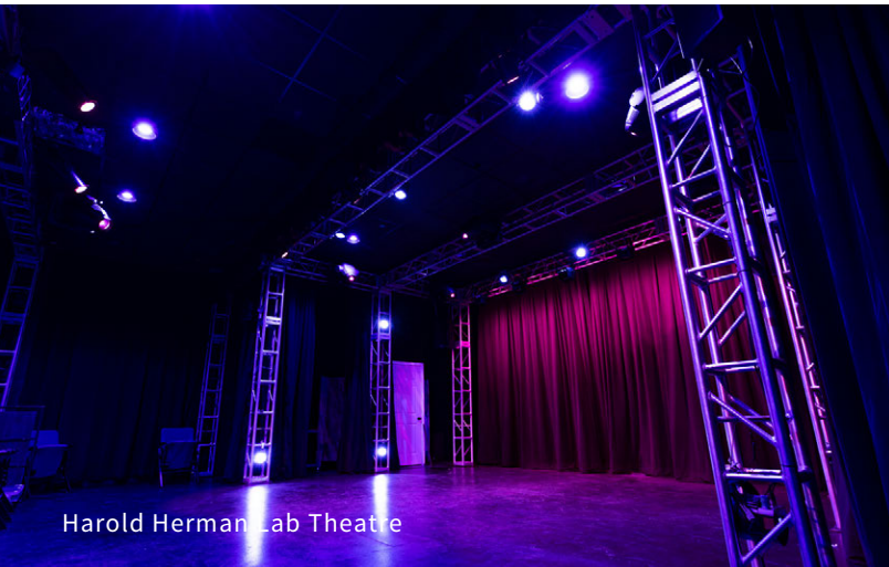
Harold Herman Lab Theatre