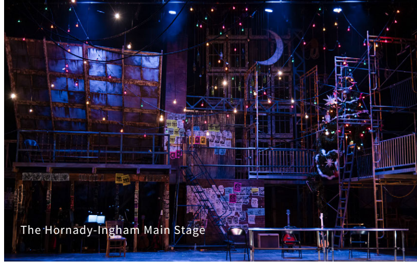
The Hornady-Ingham Main Stage