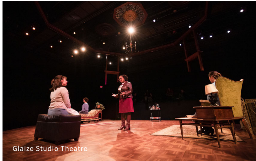
Glaize Studio Theatre