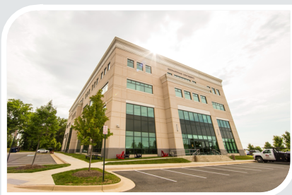
SU Loudoun 44160 Scholar Plaza Suite 100 Leesburg, Virginia 20176