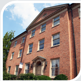
James L. Bowman Building 20 South Cameron Street Winchester, Virginia 22601