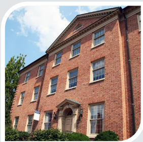
James L. Bowman Building 20 South Cameron Street Winchester, Virginia 22601