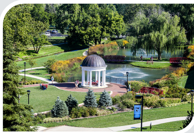
Winchester Main Campus 1460 University Drive Winchester, VA 22601