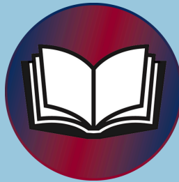
Areas of Study